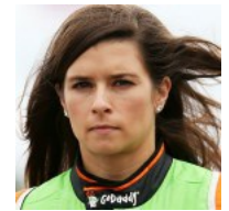
Jimmie Johnson & Danica Patrick Pay Their Penalties In Michigan