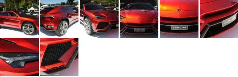
Image Credit: Lamborghini, Live gallery copyright 2015 Drew Phillips / AOL