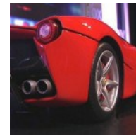
A $7,000 Ferrari Actually Exists