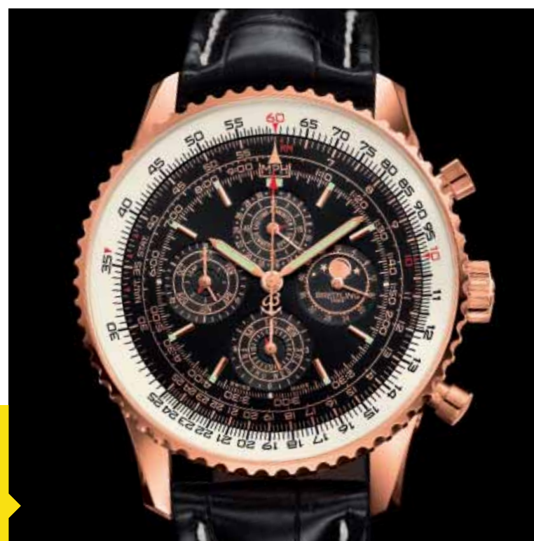
The BJT's seven L-39C Albatross jet trainers comprise the largest civilian jet display team in the world. BELOW: Breitling Transocean Unitime Pilot