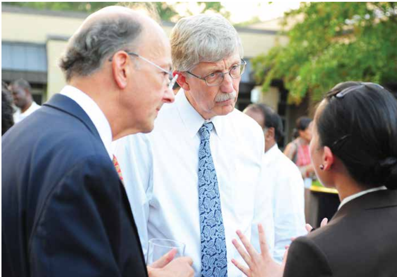
NIH Director Francis S. Collins, M.D., Ph.D., learns about one participant's experience in the Fogarty International Center's Scholars and Fellows program. Such programs help the center achieve its mission of training health researchers at home and abroad.

in the development of low-cost diagnostics and cost-efficient ways to prevent and treat disease. Research groups are best suited to address global health issues when the teams are multinational and sensitive to local culture and context.