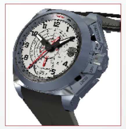
THE NEW MK. IX WILL BE AVAILABLE WITH A RANGE OF DIAL COLORS AND DESIGNS INCLUDING THIS MK. IX G WITH SILVERED DIAL AND INTEGRATED TACHOMETER SCALE.

"I'm trying to produce designs which are somewhat timeless," he continues. "I'm not really following current trends or fashions. I